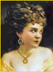
1935 Portrait of Baby Doe Tabor

The Hood partners with Opera North to present delightful excerpts from American composer Douglas Moore's The Ballad of Baby Doe . This English-language opera tells the fascinating and true story of one of the richest men in America's history, silver king Horace Tabor, his first wife, Augusta, and his second wife, Baby Doe. During the ten years of their marriage, Baby Doe and Horace lived a life of excess and squandered over twelve million dollars before Horace's death in 1893.